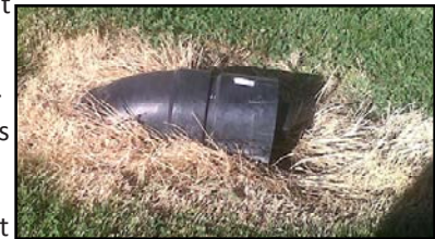
Residential irrigation riser

for irrigation boxes, placing pipe in open ditches, and cleaning out ditches. Irrigation staff has started using a weather-resistant synthetic lumber for box lids that will provide longer service life and less maintenance than wood.