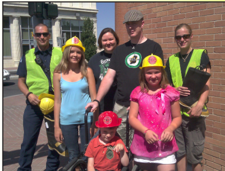
Jerome Firefighters and other volunteers raised $9,300 for Muscular Dystrophy

The Jerome City Fire Fighters fought more than the 95 degree temperatures on August 19th and 20th- the Fire Fighters also raised $9,300 in the fight against Muscular Dystrophy.