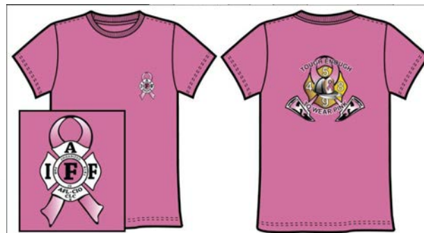
T-shirts available for $15/each from the Fire Department.

If you would like to make a donation, we encourage you to give online. It's easy! Just go to passionatelypink.org and click on "Find