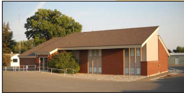
Pending a GO Bond, the Jerome Police Department is looking to move their operations to the old Fish and Game building (above).

The City of Jerome Police Department has occupied the same building at 53 South Lincoln Avenue for over 20 years. Formerly a telephone exchange, this building has served as a temporary police station since 1988 when the County Courthouse became too small for both the City Police and County Sheriff's Departments.