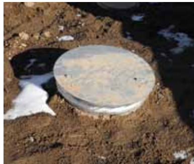
New Galvanized irrigation box

This will also improve customer service by reducing the number of complaints received. • Installing tiled ditches- The city is "tiling" or piping in some of its' ditches in an effort to reduce line blockages and provide safer neighborhoods by reducing the amount of uneven surfaces, this will also create more usable space on citizens' properties. • Implementing new maintenance schedules- By installing more preventative features to the irrigation system a more reliable maintenance schedule can be created, allowing for better utilization of staff time.