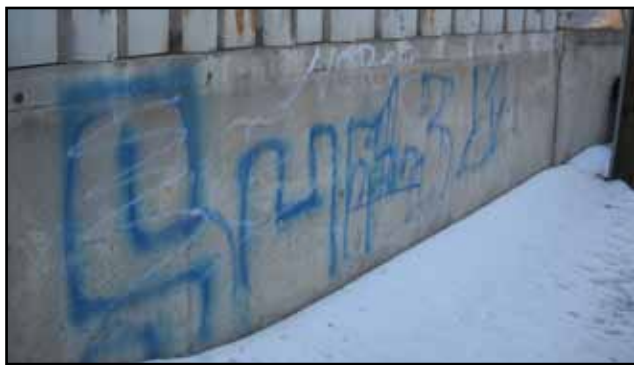
Gang related graffiti in a Jerome alley

gang members are affiliated with other gangs in larger metropolitan areas. With the efficiency of modern travel, miles of