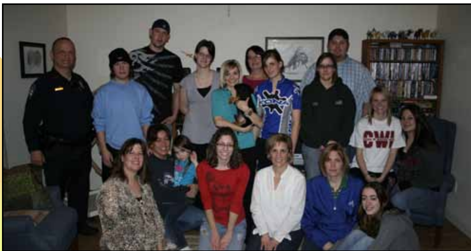
of the Volunteers for the Jerome Animal Shelter at a recent meeting. Shelter