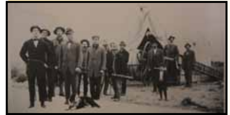
Fire Station 1, circa 1910

Before putting on his boots and bunker gear, the engineer writes down the address of the fire on a chalkboard at the fire station, making sure that the other firefighters will find the address. With hydrant map in hand, the engineer roars out of the fire station in a 1974 American La France Engine with all lights flashing and sirens blazing. En route to the fire, the engineer sees a pillaring plume of smoke rising in the northwest