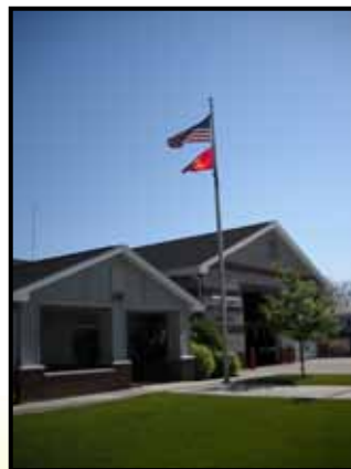
Fire Station 2, 2009

It is 1985 on a hot July Sunday afternoon. A solitary on-duty engineer has just finished cleaning the fire station. As he puts away his supplies, the fire phone on the wall begins to ring. On the second ring, the fire engineer answers the phone. On the other end, the Jerome County Sheriff department dispatch center informs the fire station that there was a possible structure fire at 809 N. Birch. The engineer writes down all of the pertinent information and immediately sounds the town's whistle.